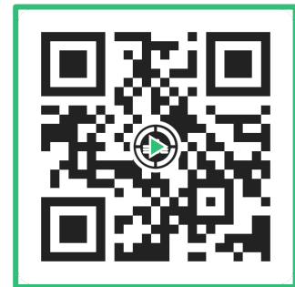
1. Download crowdDJ

Don't stop there, though! You're only halfway.