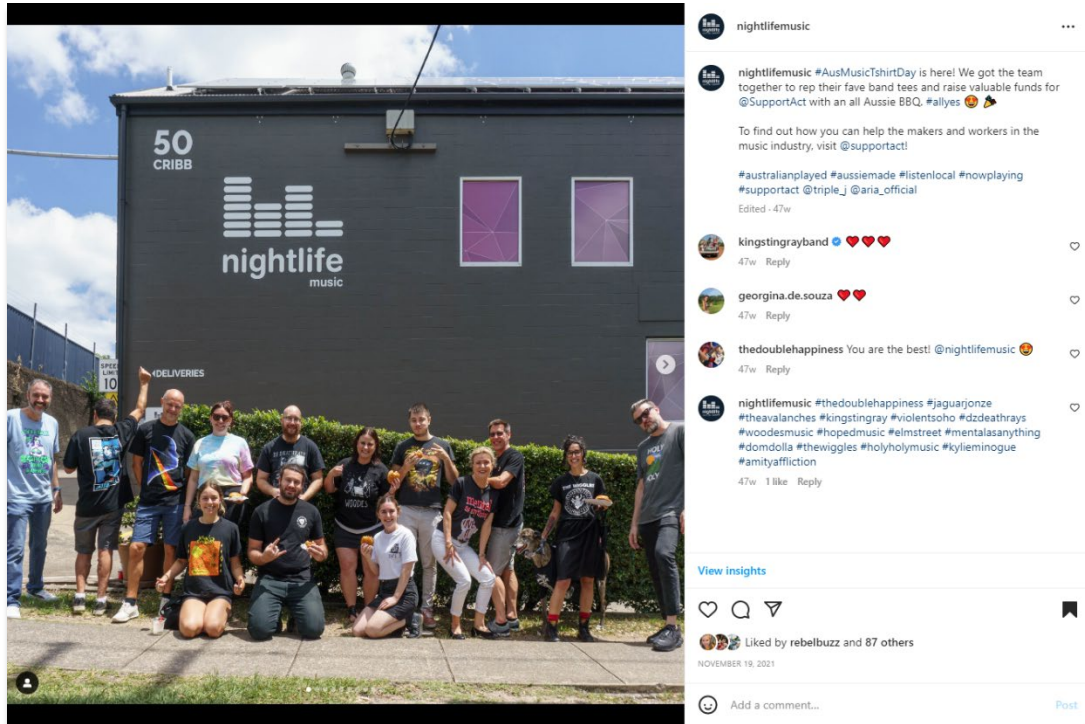
Nightlife Music's post for #ausmusicshirtday2021 [Instagram]

To learn more about Ausmusic T-shirt Day, visit the Support Act website here .